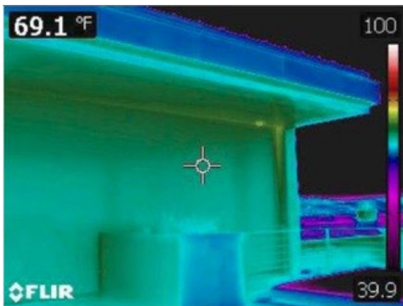
Infrared image from TNAH2016

When the screens aren't in use, they retract into cavities designed above the openings with the touch of a button, completely hiding them from view. This feature ensures that the screens don't detract from the design of the home.