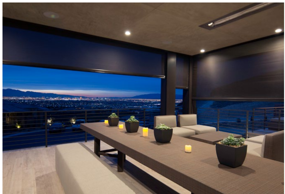
The New American Home 2016

The obvious choice for homeowners, architects, and builders is motorized retractable screens. Not only do these screens meet the need to create comfortable and attractive outdoor living spaces that enable occupants to enjoy outdoor views, they are also scientifically proven to enhance the energy efficiency of the entire home.